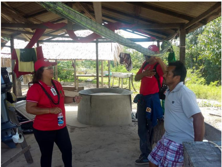
Community Nossa Senhora de Aparecida