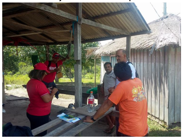
Visit to the wormen's group