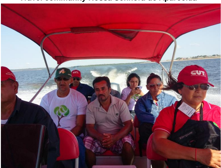
Arrival community Nossa Senhora de Aparecida